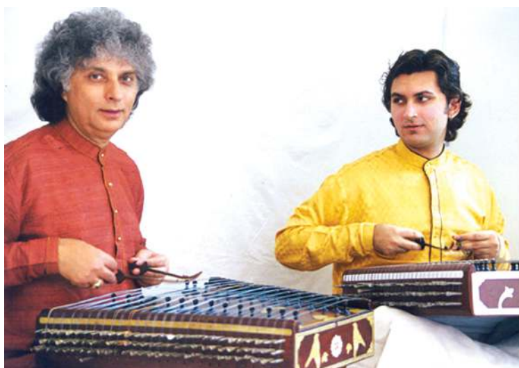
Pt. Shiv Kumar Sharma and his son Rahul Sharma

In some families, the food habits or style of dressing of some of the members are similar. Some members of a family may not like some dish or the whole family may be fond of kheer (rice pudding). In the same manner, many children follow the occupations of their parents or relatives like the son/daughter of a sports person wants to follow the same sport. The children of singers, artists, actors, builders, goldsmiths or doctors may follow the footsteps of their parents or they may want to take up some other work.