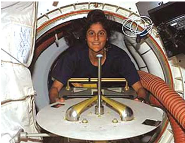
Sunita Williams coming out of spaceship

As Sunita Williams ended her space journey in United States, her relatives back home in Gujarat could not stop their tears of joy. 'She has landed safely by the grace of God. It is a moment of great joy for all of us,' said Sunita's uncle. Her relatives came out on the streets and danced till daybreak, bursting crackers and beating drums!