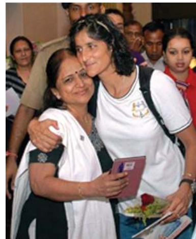
Sunita Williams with her relatives